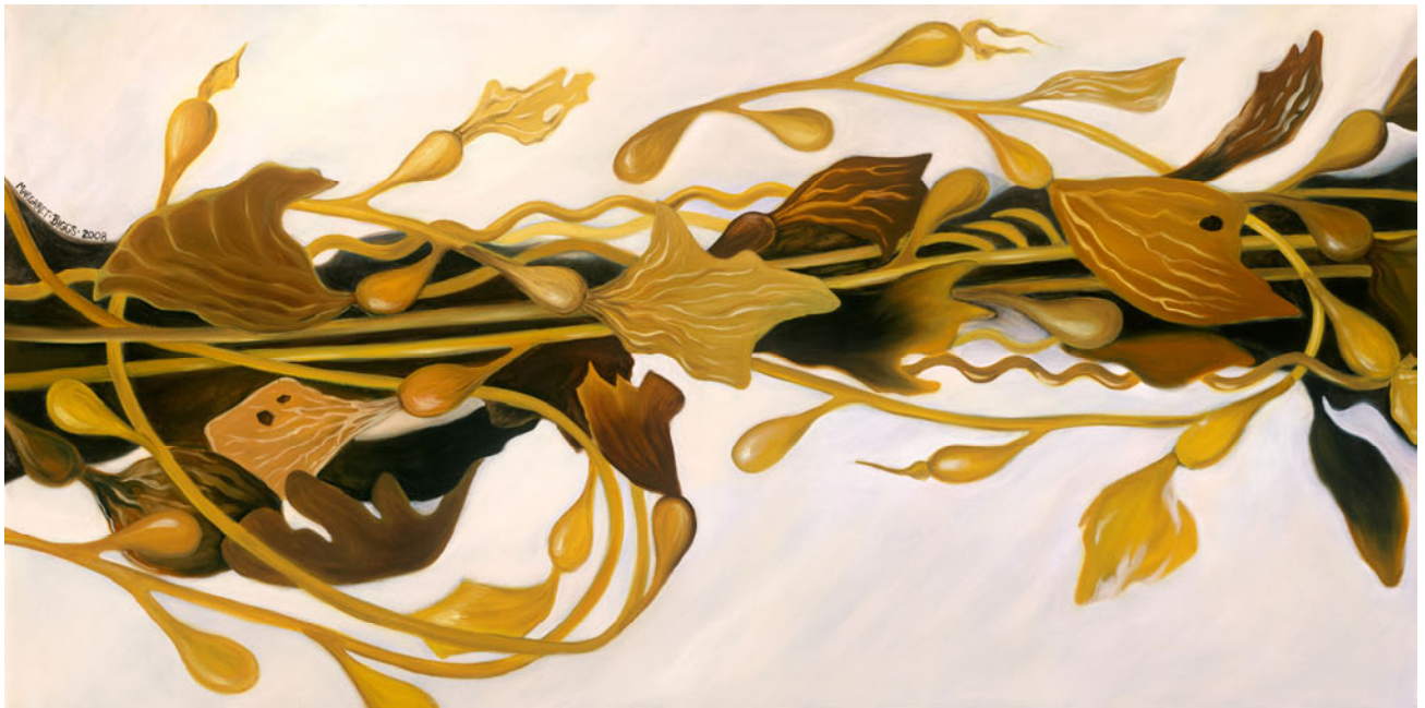
Bayside 36 x 48, top of page.